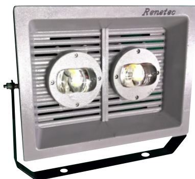
100W e 150W